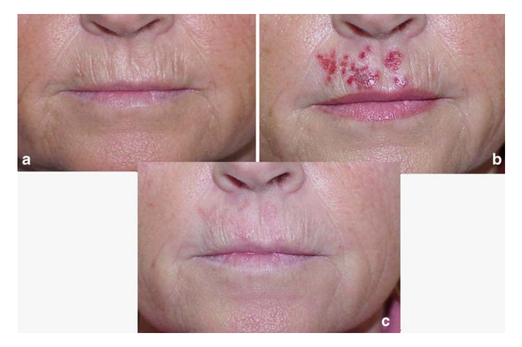
Fig. 4 Caucasian woman, 48 years old, skin phototype II, (a) before and (b) 1 week after fractional resurfacing of the upper lip. Tissue has healed after skin ablation, with clear improvement of the wrinkles; however, clear signs of herpes simplex infection are observed. c Aspect at 2 months after treatment. Herpetic lesion has healed without any scarring, but some lesion-related residual erythema is still present. Wrinkles are significantly better

Fractional resurfacing with Er:YAG laser with low incident doses and few passes for wrinkle treatment will obviously require more than one treatment session to enhance the condition of moderate to severely photo-aged skin. However, each subsequent treatment session at the same parameters will not go any further than the previous